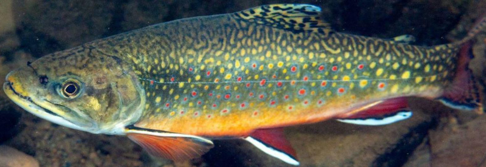
Picture: Brook trout in Seneca Creek, WV.