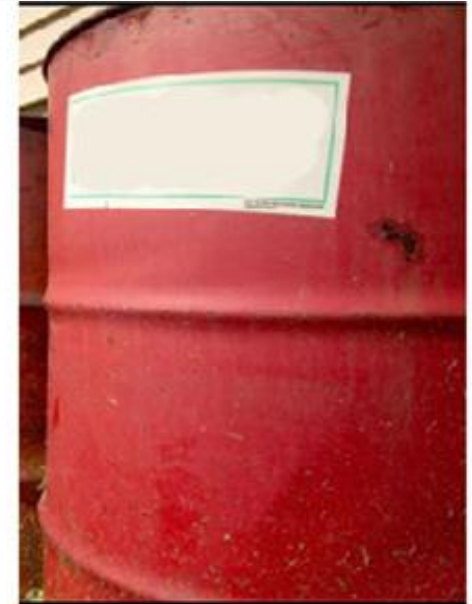
Resource Conservation and Recovery Act Subtitle C