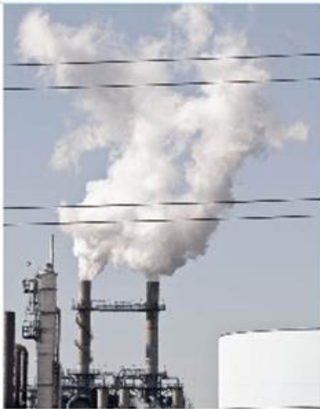
Clean Air Act Stationary Source