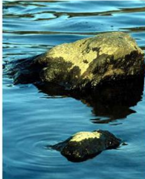
Clean Water Act National Pollutant Discharge Elimination System