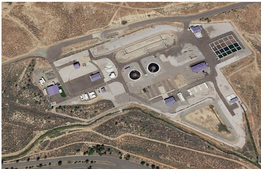
Reno-Stead Water Reclamation Facility (RSWRF)